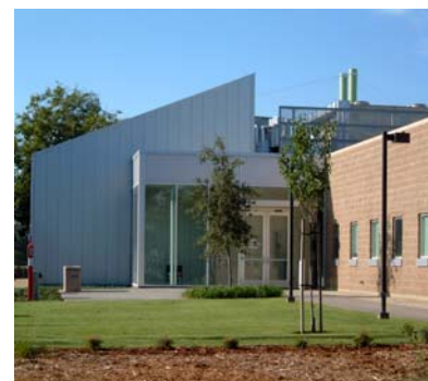
PIPRA's offices and laboratory at the University of California, Davis